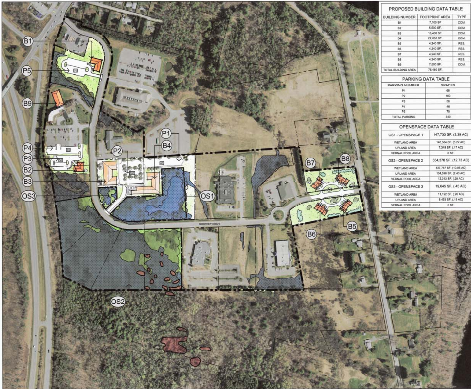
PROPOSED BUILDING DATA TABLE